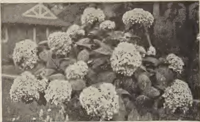
Hydrangea, French Blue

Japanese Flowering Quince. Lovely red flowers in April. Also produces fruit which makes delicious jellies and marmalade when mixed with Apples. 18-24 in., 75c each, $7.50 per doz.; 2-3 ft., $1.00 each, $10.00 per doz.; 3-4 ft., $1.50 each, $15.00 per doz.